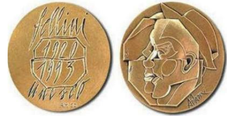
The Medaglia Fellini conferred to the winner of the “Enrico Fulchignoni” Award

Now in its 36 th edition, the “Enrico Fulchignoni” Award can be considered the most significant cinematographic acknowledgment awarded by CICT-ICFT at UNESCO to the movie presented at the Venice International Film Festival that best represents the values of peace and tolerance promoted by UNESCO.